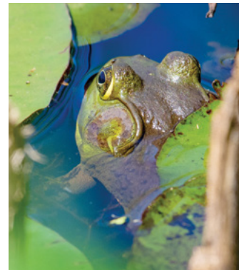
A frog in the Ponderosa's pond

We have submitted draft plans to the Fire Chief and the Department of Environmental Management. We await the scheduling of a meeting to discuss what would be required to support an application for a wetland alteration under the new rules for the various scenarios in our draft.