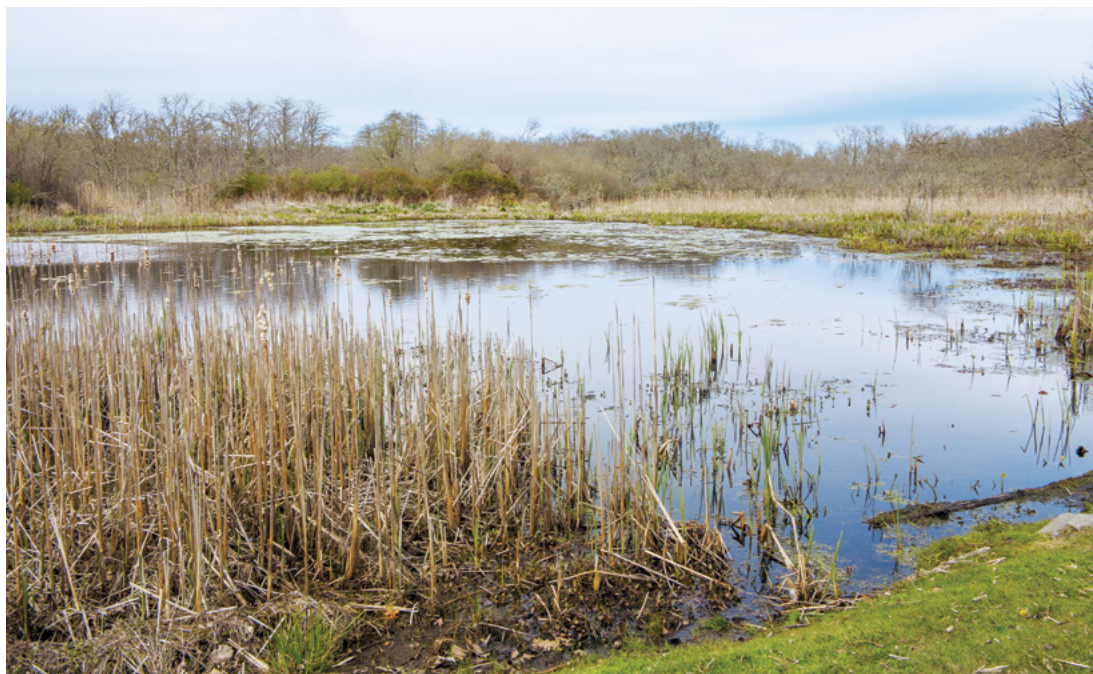
Early spring at the Ponderosa