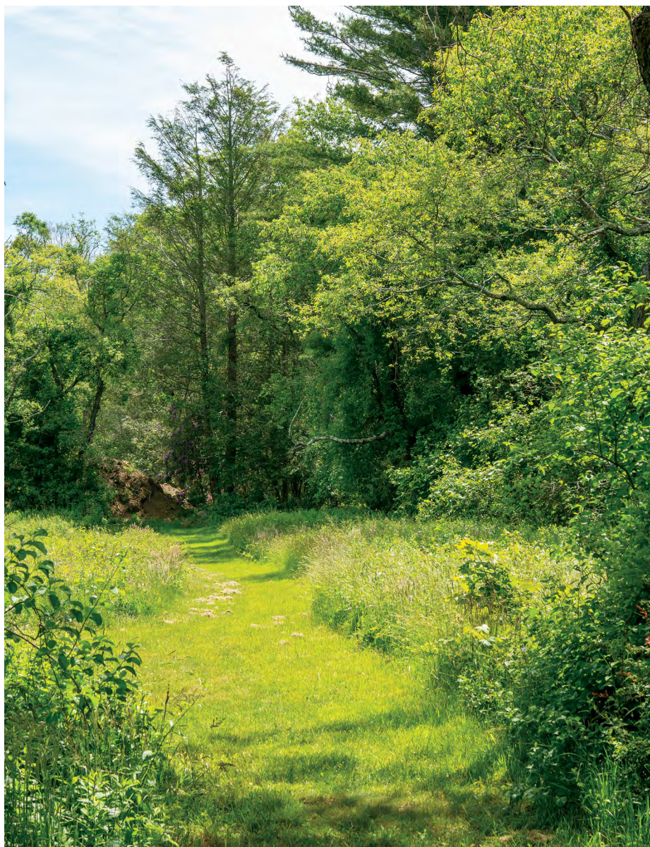
Mown path in a summer meadow, on a property where Sakonnet Preservation holds a permanent conservation easement