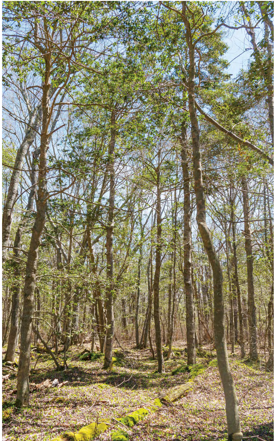
Majestic American hollies tower over this woodland on a key parcel owned by Sakonnet Preservation