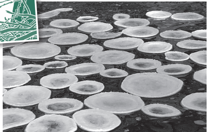
Ice pancakes in Adamsville Brook near Gray's Mill Pond.

This book is a passionate love letter to language, landscape, literature and enchantment. Macfarlane's generous, curious and learned approach urges us toward the wonder of re-engaging with nature through physical and linguistic connection. "Language does not just register experience," he writes, "it produces it."