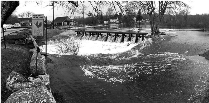
Recent flooding at Gray's Mill Pond and Adamsville Brook.