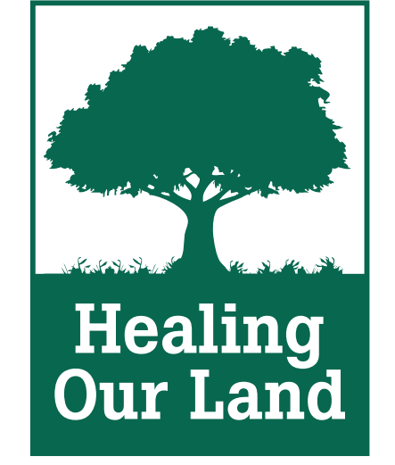
Contributed by a local landowner

other manner. We wanted an "organic" methodology. He either knew no other way to plant, or was unwilling to revert to the lower yields of old fashioned seeding techniques. Additionally, his major investment in equipment seemed geared to his present practices. After much debate, meetings with agronomists, dueling consultants, and proposals from other farmers, we told him that he must plant natural grasses for feed hay (no GMO), and use neither herbicides nor pesticides, or we would no longer allow him to farm the property. We offered that he could plant and harvest subsequent