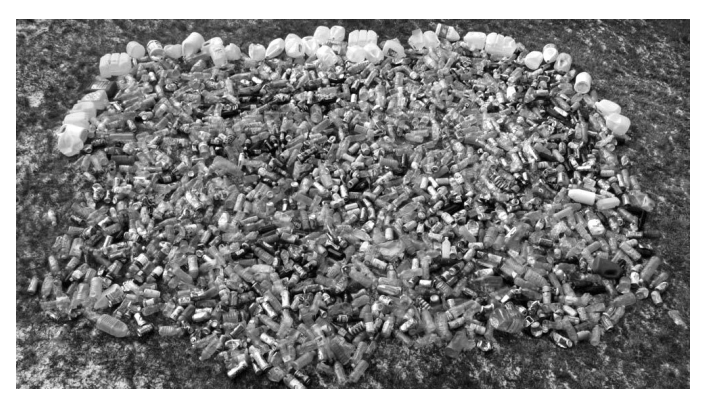
1,536 bottles and cans picked up off the Little Compton shoreline during Geoff's walks in 2014. More than 80% single-use plastic bottles. Half of them drifted ashore and half left by beach-goers. As in past years, all were sent for recycling.