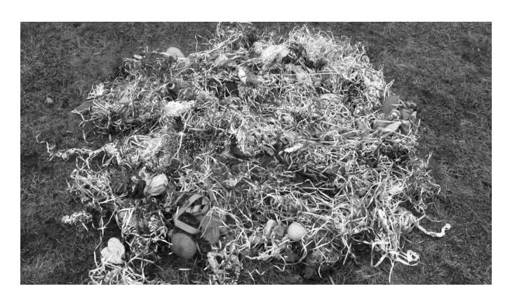
Latex beach balloons, their ribbons and ribbons from Mylar balloons found washed/blown ashore on Little Compton beaches during his walks in 2014. Balloons were from CT, NY, NJ, MD, VA and one from Washington state.