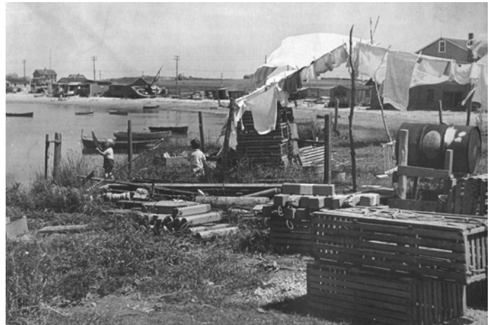
Sakonnet Harbor circa 1919